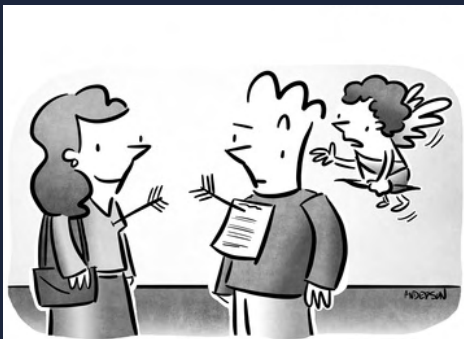
"If you could fill out the attached survey that would really help me out."

Answer: B. According to the FTC, $1.14 billion was lost due to romance scams, with median losses of $2,000 per person—the highest reported loss for any form of impostor scam.